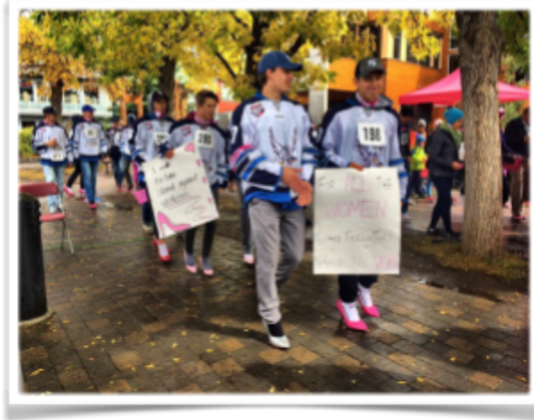
Canmore Eagles Participating in the Bow Valley Walk a Mile in Her Shoes

Choosing to partner with the Canmore Eagles not only benefits your company through advertising, but your partnership helps to benefit youth hockey and our community.